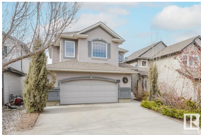
1912 121 St SW, Edmonton, AB