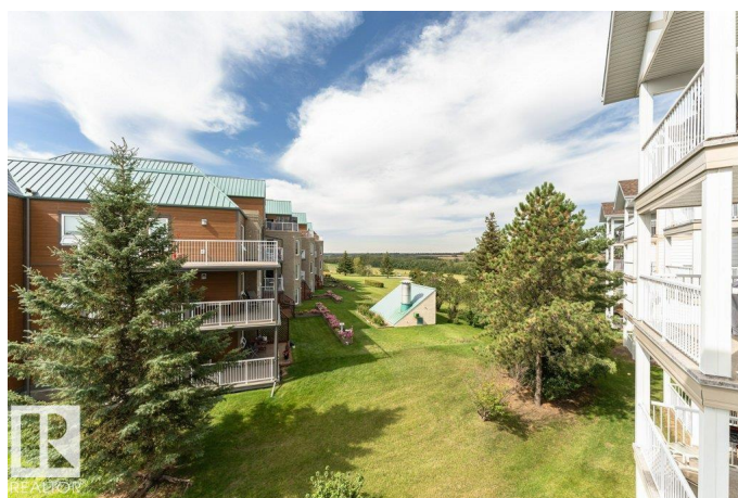
302-9930 100 Ave, Fort Saskatchewan, AB