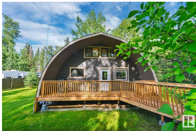
77 Township Rd 462A, Wetaskiwin County, AB