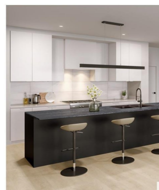
UPGRADE HOOD FAN BUILD OUT VANILLA / FLAT PANEL