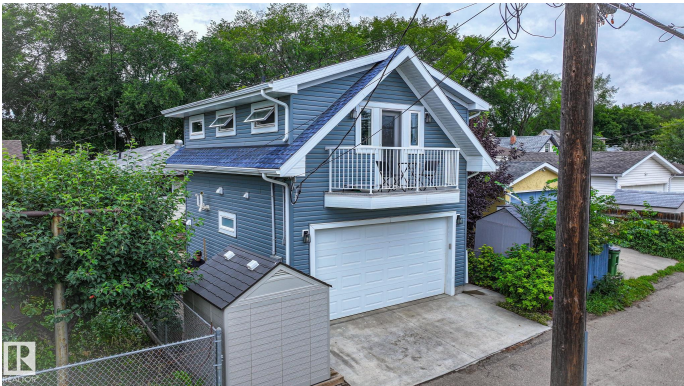
11131 52 , Edmonton, AB

This cherished generational home in Highlands tells a story. Built in 1965 by the original owners and now offered by their daughter who grew up here. In 2019, a fully self-contained, architecturally designed garden suite was added at the back of the lot, creating rare versatility for extended family, guests, or rental income. Set on a tree-lined street with towering elms, this property is steps to local gems like Foxburger, Kind Ice Cream, and Candid Coffee Roasters, and just minutes to Highlands Golf Club and River Valley trails. With historical charm, modern flexibility, and a prime location in one of Edmonton’s most beloved communities, this is a once-in-a-lifetime opportunity. A must-see! Imagine morning coffee or evening tea on the back deck surrounded by lush landscaping and lilacs in bloom. Recognized by the Highlands Historical Society with a heritage plaque, this is truly a one-of-a-kind chance to own a piece of history in a sought-after neighborhood, complete with a built-in mortgage helper.