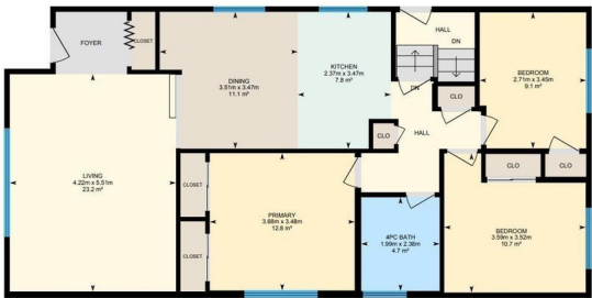
11131 52 , Edmonton, AB

Main Floor Exterior Area 107.96 m² Interior Area 101.79 m²